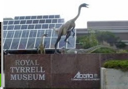
Royal Tyrrell Museum in Drumheller

The trip to Banff is scheduled for May 25, 26 & 27, 2018 inclusively . All bursary recipients are encouraged to participate in our scheduled trip to Banff. However, there are only 40 spots – these will be sold on a first come, first served basis. The itinerary includes tenting in Banff National Park, visiting and hiking at Johnson's Canyon, visiting and hiking Lake Louise, visiting & hiking at the Cavin & Basin National Historic Site in Banff, dipping in the Hot Springs, shopping in Banff, and touring the world famous Royal Tyrrell Museum in Drumheller. All meals, snacks, transportation, park entrance fees, camping site fees and group leader costs are included. As well, tents and camping gear (other than sleeping bags and mats) are provided. Please send the fee of $385 with your registration. Should you withdraw from the 5-wk Explore French Immersion program before April 27, 2018 , these fees will be refunded to you. No refunds will be issued after April 27, 2018.