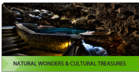
NATURAL WONDERS & CULTURAL TREASURES